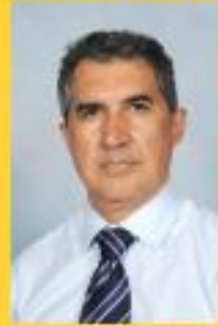
Year 10 Mr Centurion