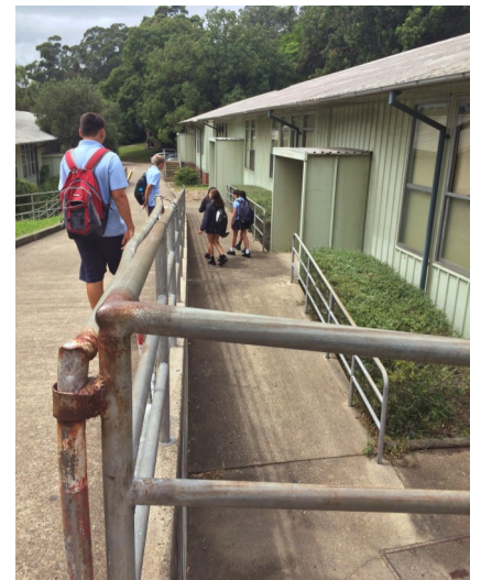
which is now the Food Tech rooms!