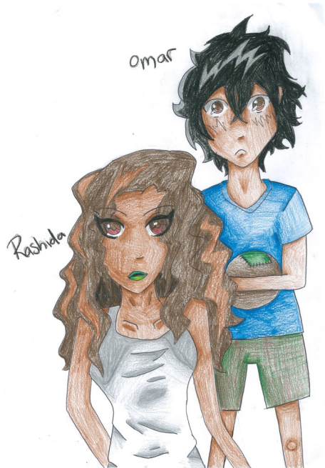
Illustration by: Ella Lanos