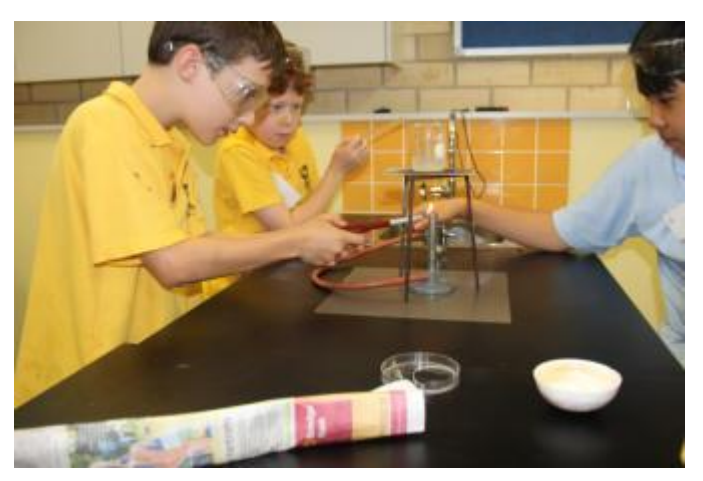
Concentration on Chemistry

To help our senior students, we also run extra tutorial classes. As parents may not be aware of when these tutorials are available, listed below are the details.