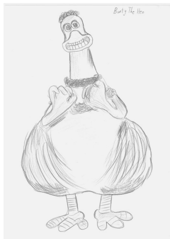
Surely Rocky can teach the chickens to fly?

A staggering 500 clay chickens were made with plasticine moulded onto metal skeletons to create the film’s many hilarious characters and beautiful backgrounds were made to help set the story and deliver an enriching experience for the audience.