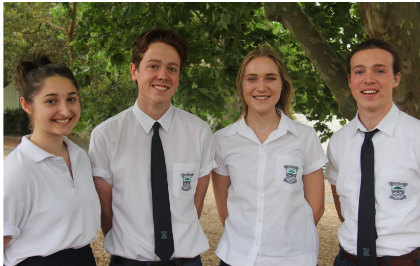
2016 Leadership Team (l-r):